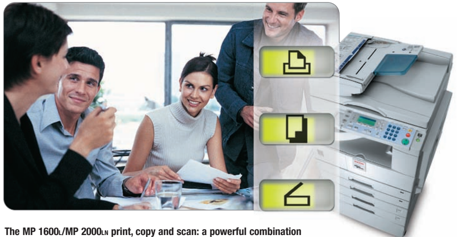
The MP 1600L/MP 2000LN print, copy and scan: a powerful combination in an ultra compact device, ready to be placed anywhere in your office.

Enhance your company's image with splendid business documents. The MP 1600L/MP 2000LN deliver the precise quality you are looking for. As originals are scanned only once, stored into memory and reproduced from there, output is impeccable at all times. Crisp and clean, your documents are set to leave a first class impression.