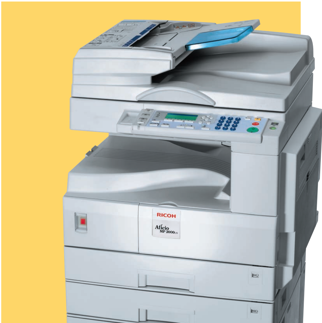
Aficio™ MP 1600L/MP 2000LN