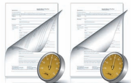
Duplex output at simplex speeds

Create double-sided prints and copies without compromising on productivity. As the MP 2000LN takes care of duplex output at simplex speeds, you need not worry about delays. Along with saving on paper costs, you safeguard the environment.