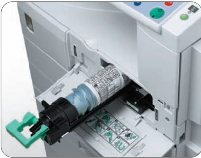
Full front accessibility for optimum ease of use and simple maintenance.

You need office equipment that is easy to operate and maintain. Spending time on complicated user manuals and technical training is definitely out of the question. The MP 1600L/MP 2000LN make sure you can put your time to much better usage. With their straightforward operation panel and full front accessibility, anyone can print, copy and scan with the greatest ease. No expertise required in the long run either: the systems are virtually maintenance free.